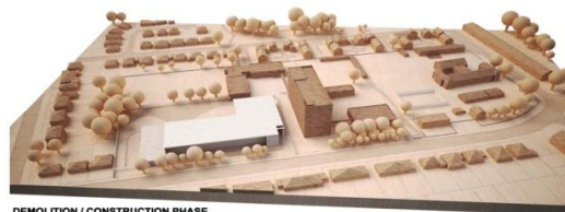
DEMOLITION / CONSTRUCTION PHASE